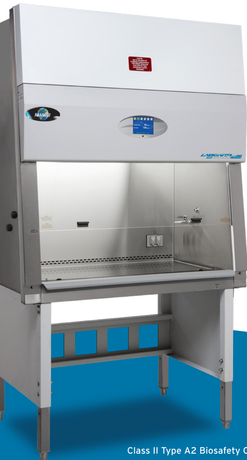
Class II Type A2 Biosafety Cabinet

www2.nuaire.com/BSC-Selection-in-Context-of-RA