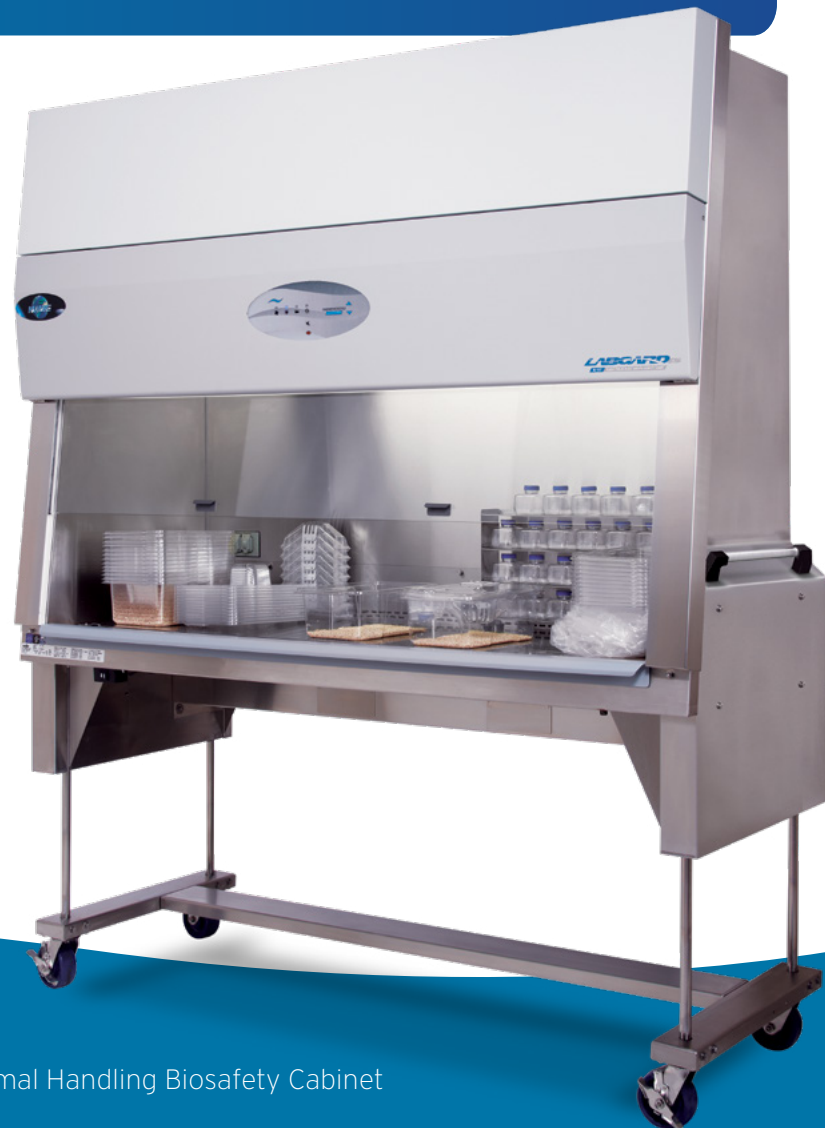
Class II Type A2 Animal Handling Biosafety Cabinet

This article explores the types of equipment commonly used in animal research facilities and key selection criteria, beginning with foundational design principles.