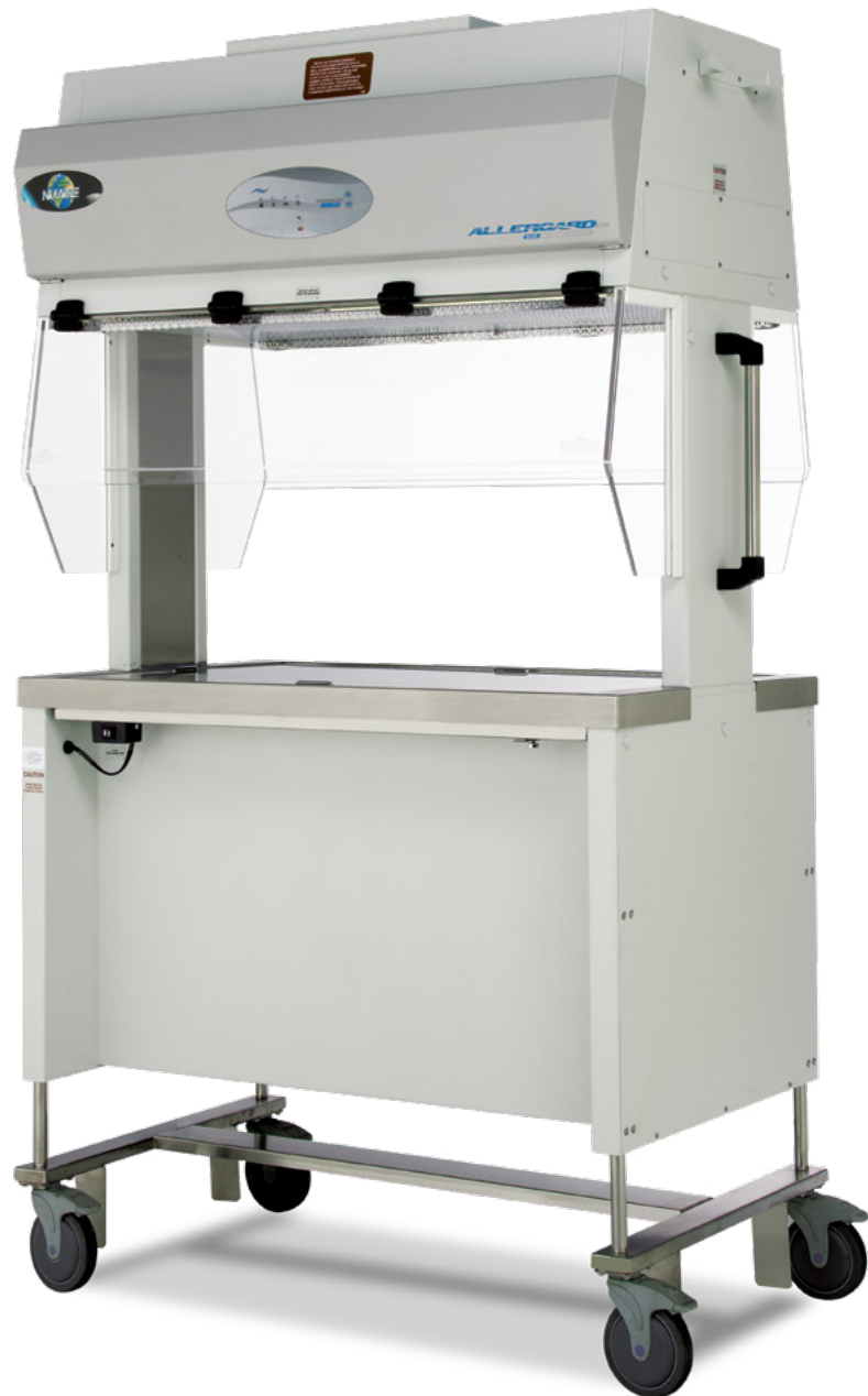
Animal Transfer Station

Maneuverability is essential, with high-quality casters that allow for easy relocation, even in tight spaces. On some occasions, customizations may be required. Experienced manufacturers anticipate these potential requests and design their equipment to be modified cost-effectively.