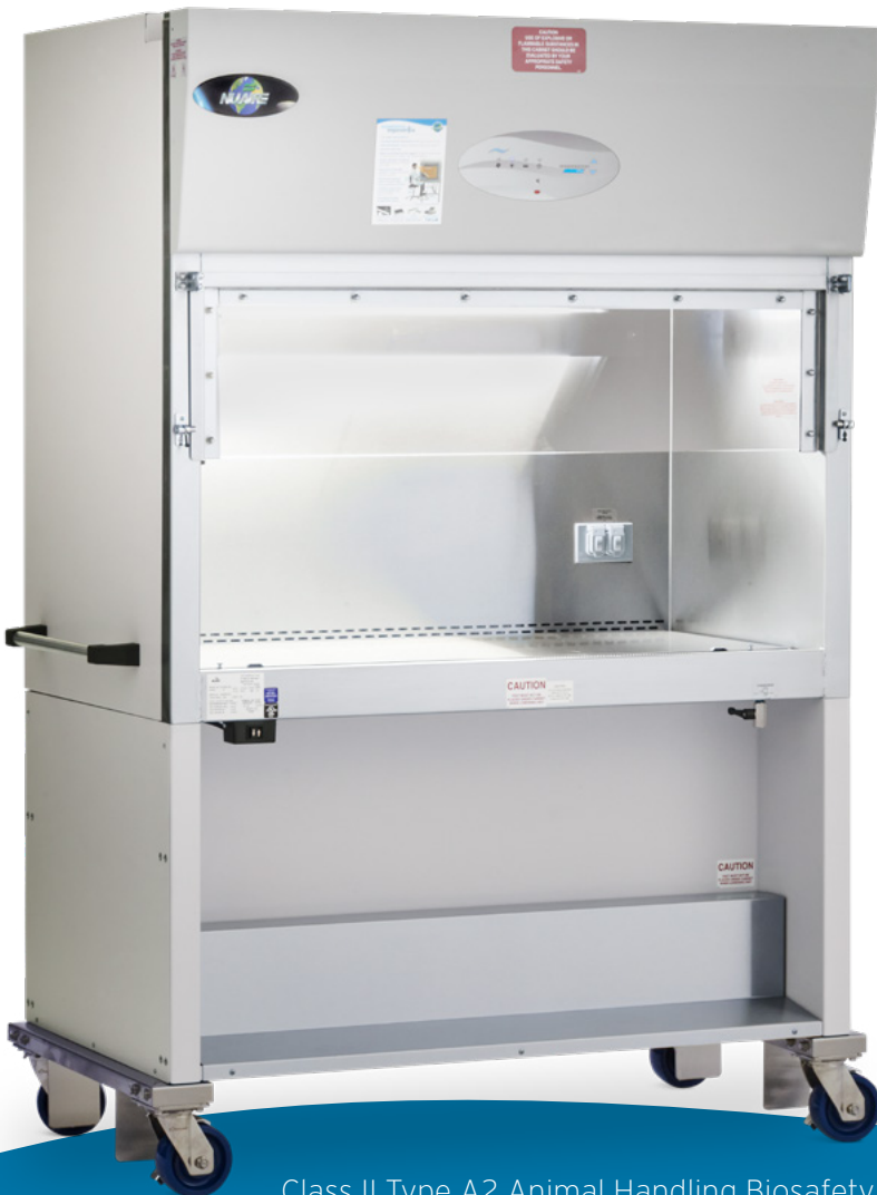
Class II Type A2 Animal Handling Biosafety Cabinet

Although the typical sash height for NSF/ANSI 49 BSCs is 8 or 10 inches, some manufacturers offer higher window heights that are fully NSF/ANSI 49-compliant. Extra sash height (e.g. 10 or 12 inches) can allow users more vertical workspace, making it easier to handle animal cages, thus improving overall user ergonomics.