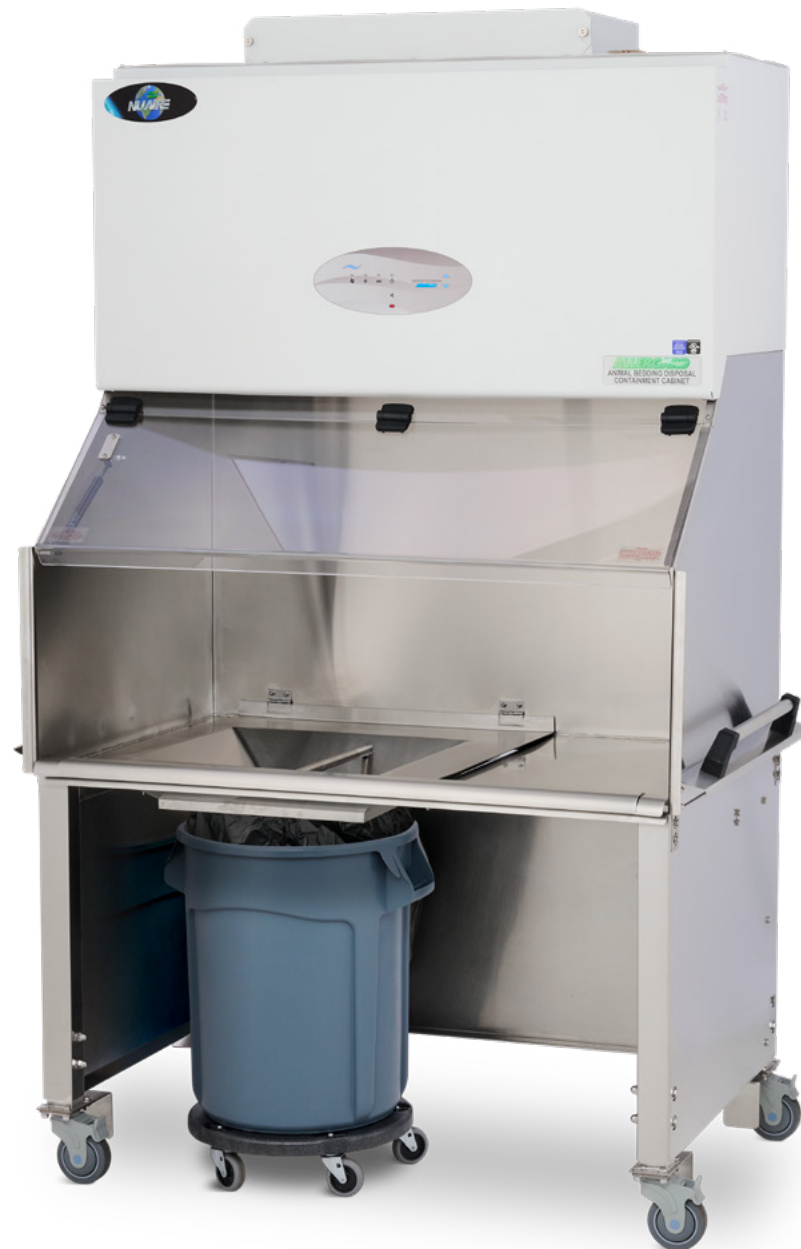
Animal Refuse Workstation

For facilities dealing with frequent cage dumping and high waste volumes, a refuse workstation is best suited to manage odors, allergens, and particulates. When choosing equipment, consider the level of containment needed, frequency of use, ergonomic demands, and type of work performed. This structured approach helps ensure equipment is fit-for-purpose, without compromising biosafety or workflow efficiency.